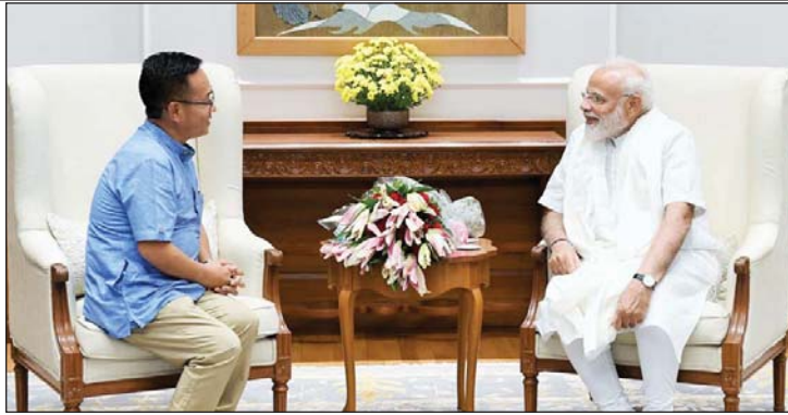
The Chief Minister of Sikkim, Shri Prem Singh Tamang calling on the Prime Minister, Shri Narendra Modi, in New Delhi.

Seven IN aircraft and three helicopters are standby for deployment. Two Diving & Rescue teams and three Medical teams are ready to render necessary assistance. Preparations have been undertaken to setup community kitchen at Dwarka and Porbandar. Aircraft and helicopters will be deployed for the damage assessment and Search and Rescue operations as required. The Western Naval Command, Mumbai is closely monitoring the developing situation. IN Ships Chennai, Gomati and Deepak at Mumbai have been embarked with HADR/ Relief Material, and are ready to be deployed at short notice. In addition, 5000 litres of drinking water is also being embarked on board IN ships. Seven IN aircraft and three helicopters are standby for deployment.